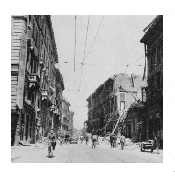
Via Manzoni in Milan after an air raid in 1943

In 1943, with the virtual division of Italy, communication between the bank's head office in Milan and the branches in the liberated south of Italy became particularly difficult. In 1944, BAI split into two separate units: the branches in the central and southern parts of Italy reported to a new head office in Rome, whilst the branches in the north continued to report to Milan. One branch, at Castelnuovo di Garfagnana, remained in a sort of 'no man's land' between