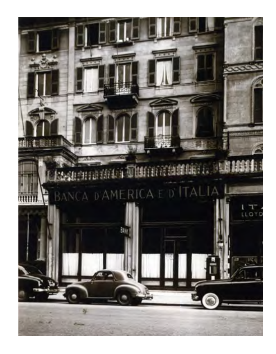
Two Ligurian branches in the 1960s: Rapallo (left) and San Remo