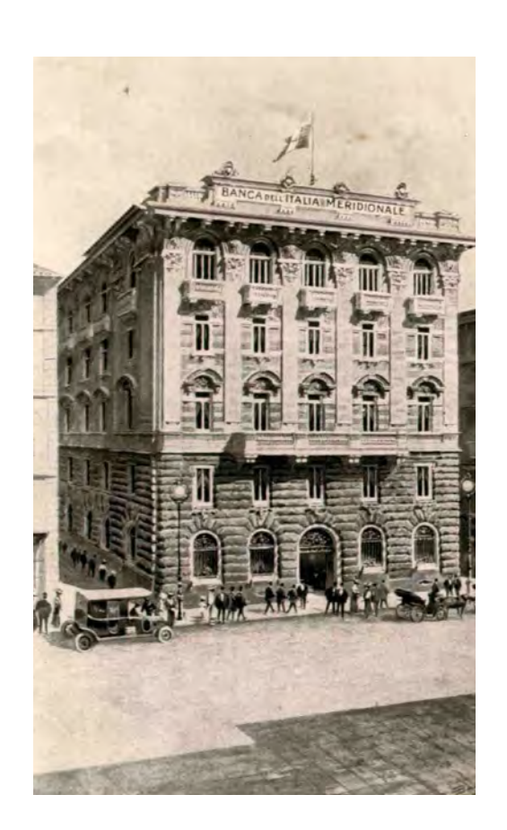
Banca dell'Italia Meridionale in Naples

The bank opened for business on 15 June 1918 in what would prove to be a difficult period immediately after the end of the Great War. Its capital was immediately increased from 3 million lire to 15 million lire and premises were rented in Naples at 11 Via Santa Brigida, in the same street where Deutsche Bank still has its main Naples office. The bank opened to the public even though building work on the premises was not finished until early 1920. In its 1919 annual report the bank writes, with charming sincerity, that "all shareholders, who know in what conditions our beloved officers and staff have to work, will want to thank them warmly, and will also want to extend their thanks to the customers, who have, perforce, to be received in cramped and unsuitable premises but who have never complained and have always praised the speed with which the bank works and the politeness and competence of our staff".