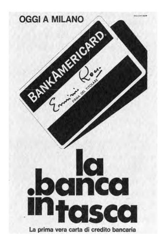
In 1969 BAI introduced BankAmericard as the first bank-operated credit card on the Italian market

able to play a particularly important role in the financing of foreign trade and investment.