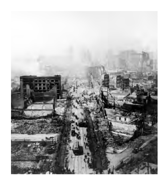
Giannini's Bank of Italy in San Francisco was the first to reopen after the earthquake of 1906

When San Francisco was devastated by an earthquake in April 1906, Giannini's Bank of Italy was the first to reopen in the rubble of the city and, by channelling the savings of other Italian émigrés towards the reconstruction of San Francisco, the bank made a major contribution towards the economic recovery of the area and, at the same time, laid the foundations for the growth of the Bank of America empire.<sup>1</sup>