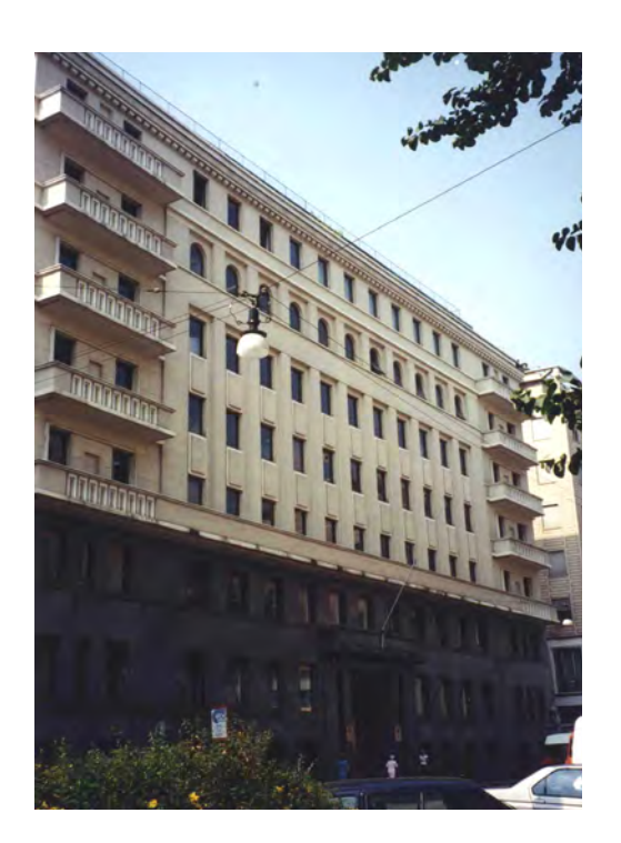
BAI's premises in Via Borgogna, Milan, in the late 1970s

In 1976 the bank acquired its head office building in Milan's Via Borgogna, and the various head office departments were moved there between 1977 and 1978 after substantial restructuring work had been completed. The considerable investment in fixed assets, including the new data centre, as well as the need to ensure that the bank remained adequately capitalised in a period of high inflation meant that the bank stopped paying a dividend in 1977 and only resumed it 15 years later in 1992. Foreign business volumes continued to grow, although the bank no longer occupied the predominant position in international business in the Italian market that it had had in the 1950s and 1960s.