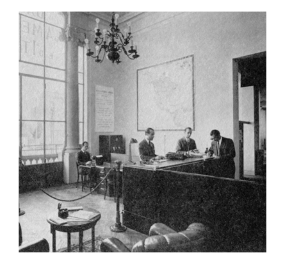
Branch at the Milan trade fair in 1930