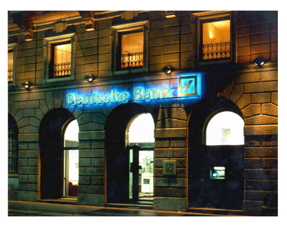
In 1994 the name 'BAI' was changed to 'Deutsche Bank'

It was for this reason that the decision was taken to change the name 'Banca d'America e d'Italia SpA' to 'Deutsche Bank SpA' with effect from 1 October 1994. There was much regret at the demise of an historic name, which had lasted for 72 years, and all branches held 'farewell' parties to mark the event.