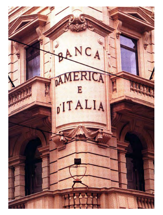
BAI's head office in Milan's Via San Prospero in the 1980s

be ready to meet the challenge of the Single European Market, which had already been planned for 1992. Deutsche Bank was one of the few institutions with the capital strength needed to make such a sizeable purchase in cash.