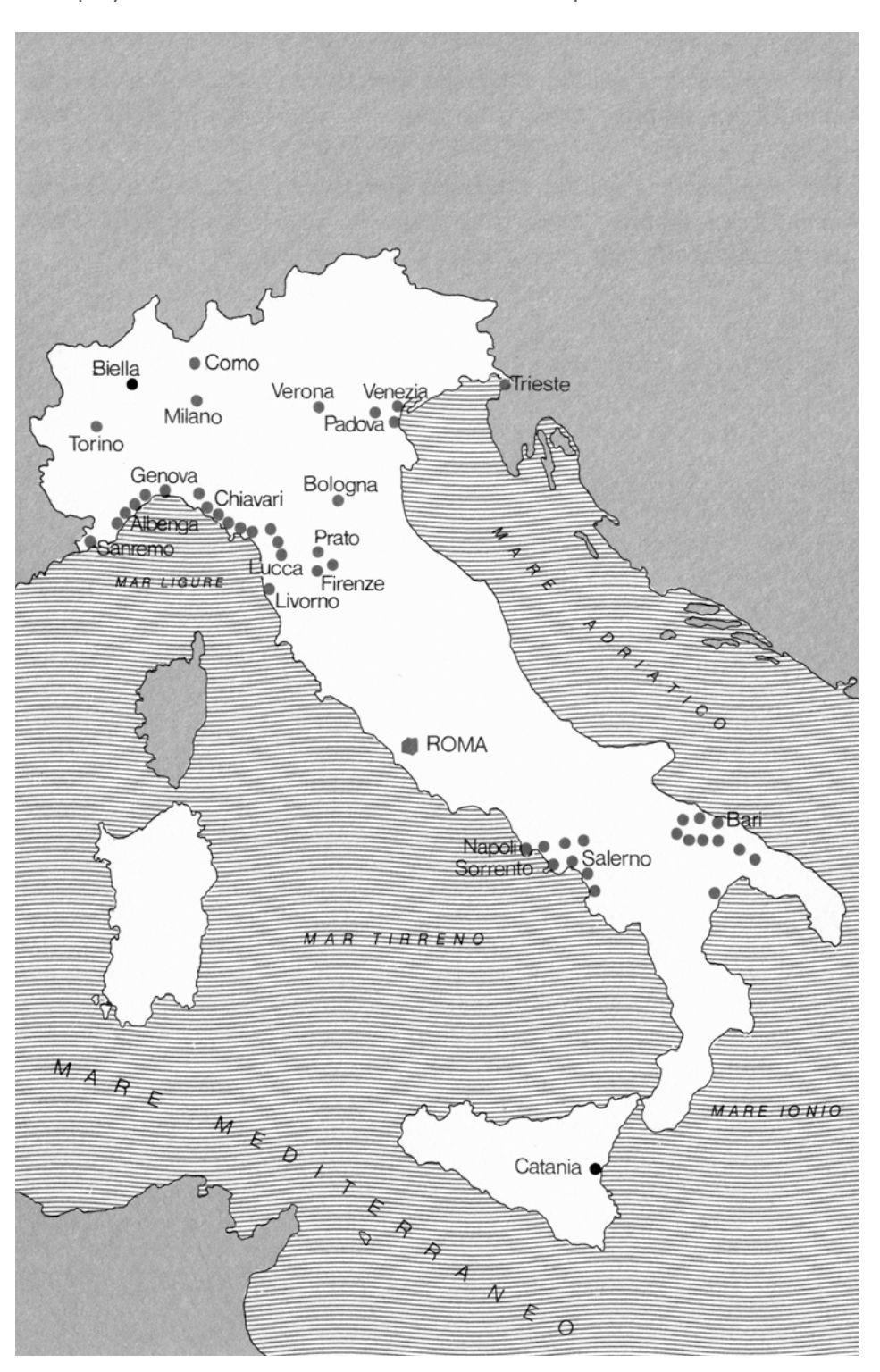
In the 1970s the Italian branches of BAI were still concentrated in Liguria, Puglia and around Naples

In 1970 a new data centre was opened at Vignate San Pedrino near Milan, which continued until the centre in the western suburbs of the city was opened in 1984 after three years of redevelopment. A representative office was opened in London in 1971, and the branch network continued to grow, albeit less rapidly than previously. A new branch was opened in 1979, four in 1980 and four in 1983, including for the first time important locations such as Verona, Padua, Como, Cuneo and Pescara.