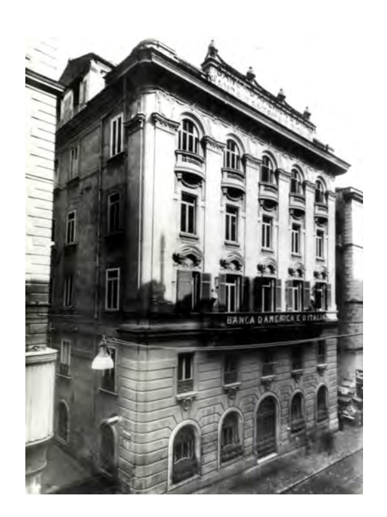
Head office of the bank in Via Santa Brigida in Naples, which changed its name to Banca d'America e d'Italia in 1922

On 29 March 1923, it moved its registered legal office from Naples to Rome, which reflected its greater geographical expansion in the centre and north of Italy (the head office had already been moved to Rome in November of the previous year). Its territorial expansion in various regions of Italy continued at a remarkable pace: the relocation of its head office to Rome in 1922 had co-incided with the opening of a main branch in that city. 1923 was a particularly eventful year in the bank's early history. There were three further acquisitions: Banca Italiana di Sconto di Bologna, Banca Nazionale di Credito di Chiavari (Genoa), and Banca Immobiliare Italiana (Milan). 1923 was also