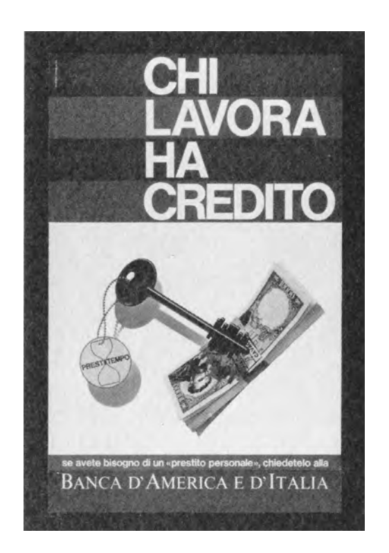
Small customer loans were launched under the Prestitempo brand in 1965

In 1960 BAI inaugurated its operations centre, and this radically changed the bank's internal systems. In the same period BAI contributed to the establishment of two new financial institutions whose aim was to stimulate mediumterm economic development in Italy and overseas: the first was Interbanca - Banca per Finanziamenti a Medio e Lungo Termine SpA, founded together with Banco Ambrosiano and Banca Nazionale dell'Agricoltura; the second was Société Financière pour les Pays d'Outre-Mer (SFOM), whose main field of activity was in under-developed countries. SFOM was founded in collaboration with Bank of America, Banque Nationale de Paris, Banque Bruxelles Lambert and Dresdner Bank. BAI at this time was at the forefront of the economic boom in Italy and, thanks to its longstanding international links, was