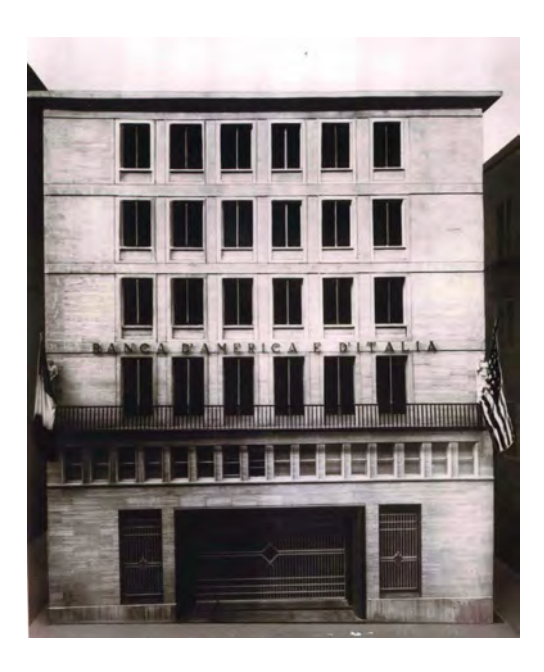
BAI's Naples branch decorated with the Italian tricolour and the Stars and Stripes in 1966

In 1949 a further capital increase of 50 million lire took place whilst business volumes continued to grow; further capital increases of 100 million lire were carried out in 1951 and 1952 to bring the capital up to 500 million lire. Between 1940 and 1950 the bank's total assets grew more than 70-fold from 1.02 billion lire to 75.45 billion lire, whilst its net equity doubled from 226.32 million lire to 550 million lire. Between 1938 and 1954 the bank's deposits increased 228-fold compared with the national average of 83-fold. Despite this rapid growth the annual report is careful to emphasise at all times that the main criteria of management are founded on prudence and the necessity to maintain a high degree of liquidity.