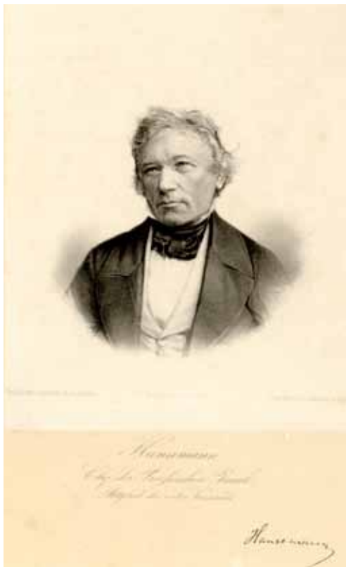
David Hansemann's Portrait as head of Preußische Bank around 1850.

With Camphausen having resigned, discouraged, in June 1848 David Hansemann was entrusted with forming a new cabinet. The new Prime Minister was Rudolf von Auerswald who, though he came from the old nobility, sympathised with the moderate Liberals. Hansemann was appointed Finance Minister again. His priorities were to continue constitutional reform and put state finances in good order. But he was not given much time for it. In September 1848 the Conservative powers in Prussia gained the upper hand again. The Liberal cabinet was dissolved. Hansemann's short career as a Finance Minister ended after just nine months.