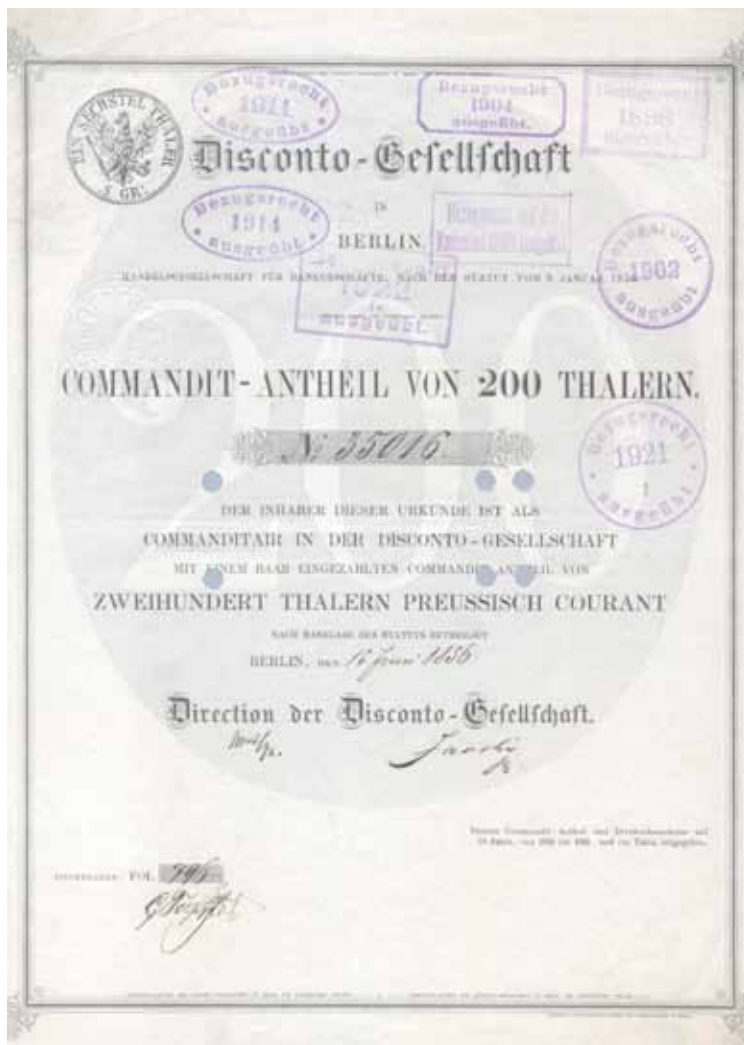
Limited partner's share certificate of Disconto-Gesellschaft from 1856 worth 200 thalers.

it was decided that in future loans would not only be awarded on the basis of bills of exchange, but also on the basis of bank annuities and shares. Simultaneously, the maximum amount of company shares, which was initially only 10,000 thalers was raised to 60,000 thalers. In a second step, executed at the General Assembly on 9 January, 1856, it was resolved to convert Disconto-Gesellschaft into a private limited partnership based on shares. It received limited liability capital of 10 million thalers, issued in shares of 200 thalers. The legal structure of a private limited partnership based on shares that Hansemann selected exploited a loophole in Prussian legislation. Whereas stock corporations needed a concession from the government, private limited partnerships needed no such concessions, which were awarded only in a few cases.