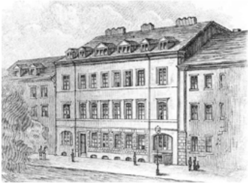
The first premises of Disconto-Gesellschaft in Kleine Präsidentenstraße in Berlin, where the bank was housed until 1858.

the new Articles of Association, the birth certificate of the firm »Direction der Disconto-Gesellschaft« were signed. The members of the Disconto-Gesellschaft were made up of two groups – the owners and the sleeping partners. The owners alone represented it in public and consequently as far as the authorities were concerned, and because they were private business men they were only subject to the general civil regulations. They were fully liable for the firm. The sleeping partners were exempt from being held liable by third parties, they only appeared within the firm through their taking over a redeemable share of the business, whose upper limit was 10,000 thalers and whose lower limit was 200 thalers of which only 10 percent had to be paid in cash. The bodies of the firm were the “Direction” (management) composed of the owners, the Administrative Board consisting of representatives of the sleeping partners, and the General Assembly, with all members owing shares worth 1,000 thalers upwards being entitled to vote. For the shareholders, mostly Berlin businessmen and workmen, it was particularly interesting that this partnership also included the right of discounted bills from Disconto-Gesellschaft to the full amount of the share in the business. The bank only awarded the loan on the basis of bills of exchange being discounted, a principle that is already indicated in the name »Disconto-Gesellschaft«.