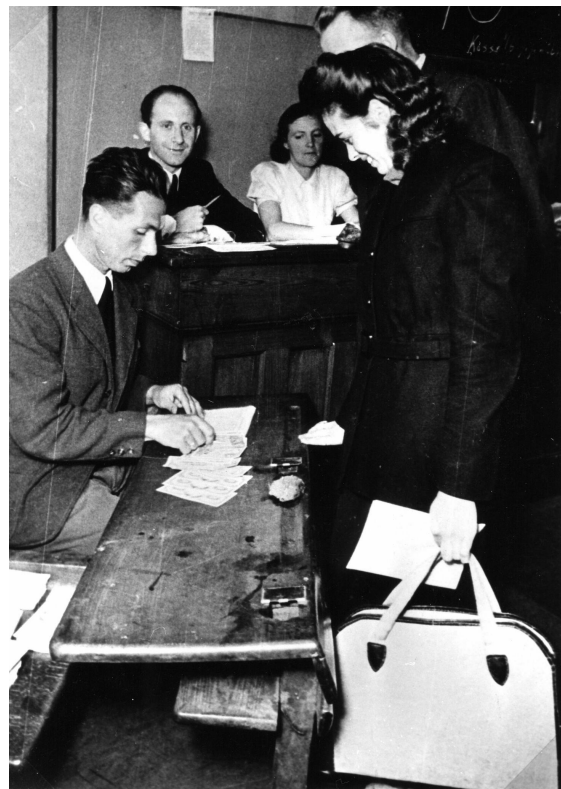
The new money being issued on June 20, 1948, in Bremen.